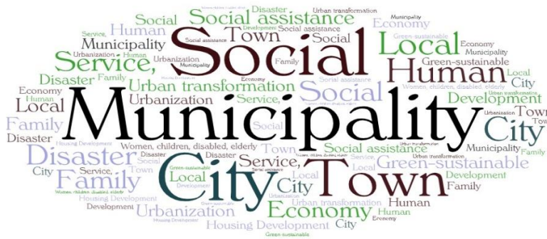
Figure 1: Justice and Development Party Word

It emphasized issues such as managing cities with digital technologies, disseminating open data management, and encouraging active participation of citizens in local governments.